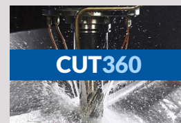
Metal Cutting Fluids