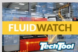
On-site Fluid Monitoring, Lab Analysis and Performance Prediction