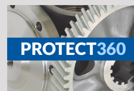
Rust Preventatives and Lubricants

360° OF PRODUCTION PROTECTION FOR: ENERGY | AUTOMOTIVE | AEROSPACE & DEFENSE | REMANUFACTURING TRANSPORTATION | CONSTRUCTION & HEAVY EQUIPMENT