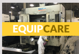
Onsite Equipment and Facility Cleaning Services