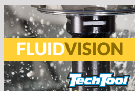
Fluid Performance Reporting and Management