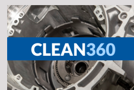
Cleaners and Degreasers