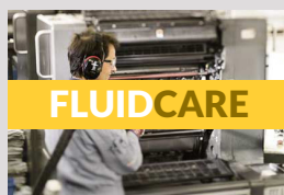
Onsite Fluid Management Services