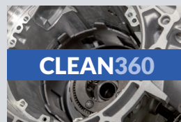
Cleaners and Degreasers