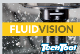
Fluid Performance Reporting and Management