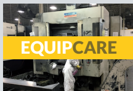
Onsite Equipment and Facility Cleaning Services